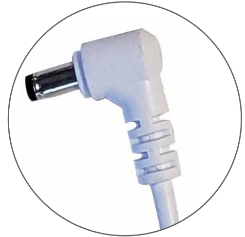
Qty.1 - 6' DC Cable