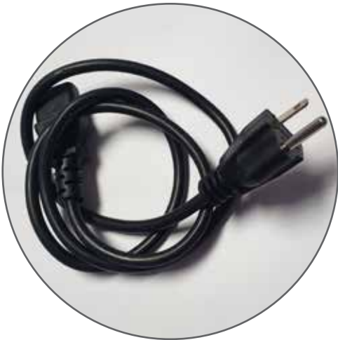
Qty.1 - UL Power Plug