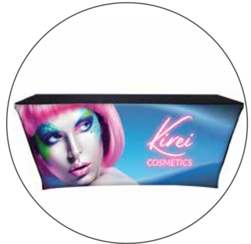
Qty.1 - 4 Sided Graphic w/ Full Color Front Side