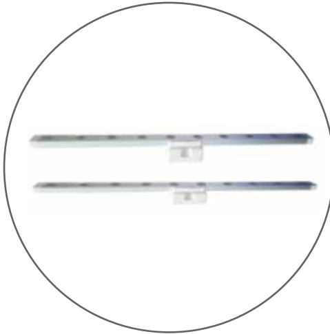
Qty.2 - 20w LED Strips