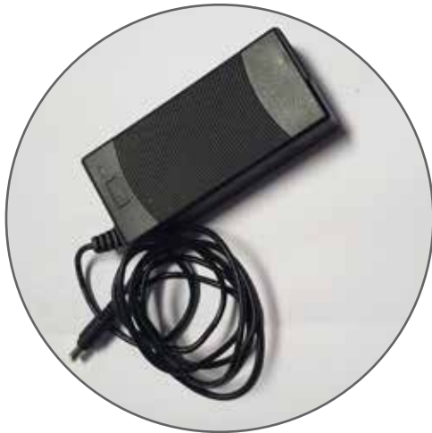
Qty.1 - AC Transformer