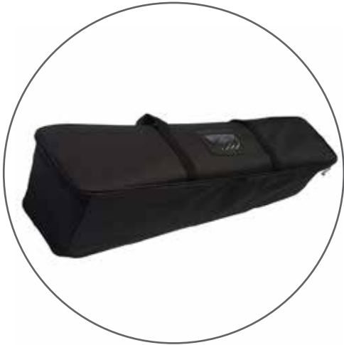
Qty.1 - Nylon Carry Bag